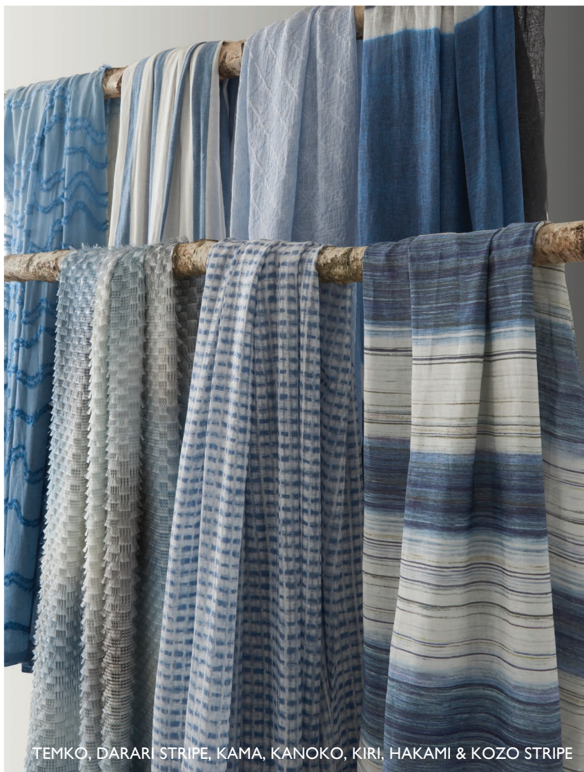
TEMKO, DARARI STRIPE, KAMA, KANOKO, KIRI, HAKAMI & KOZO STRIPE

KIRI – this glamorous single-width drapery features a chequerboard of fringing enhanced by a digitally printed space-dyed effect.