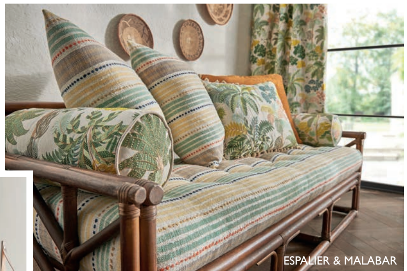
ESPALIER & MALABAR

The companion EMPYREA WALLPAPER collection is digitally printed, including four large-scale mural designs.