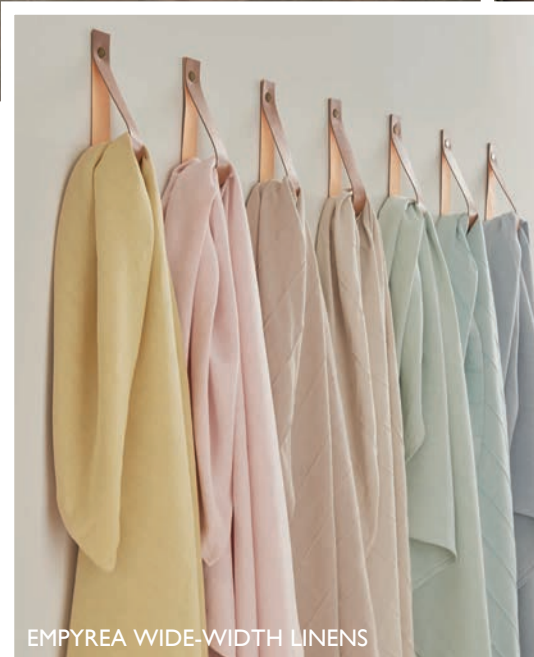
EMPYREA WIDE-WIDTH LINENS