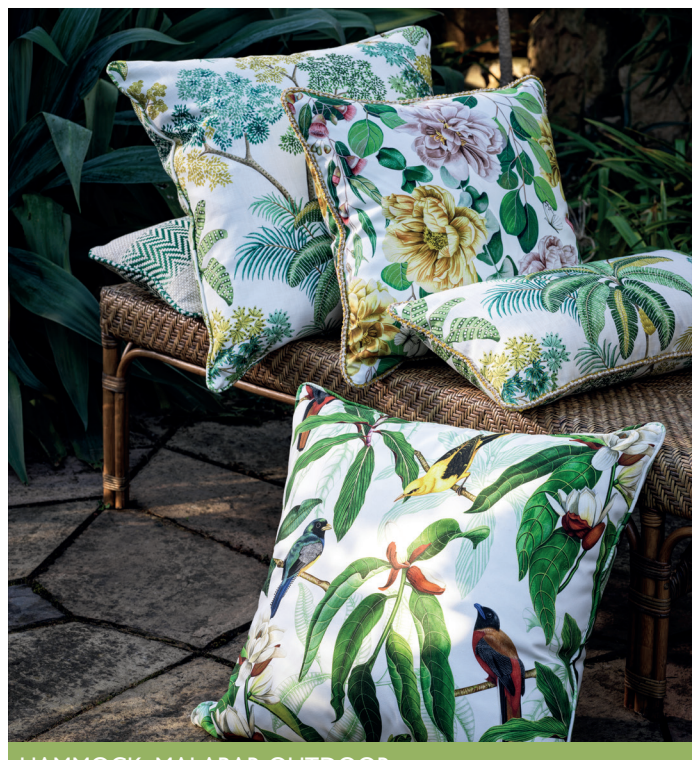
HAMMOCK, MALABAR OUTDOOR, PEONIA & MICHELIA OUTDOOR

PEONIA – originally designed for wallpaper, flowering eucalyptus, peony blooms and small white butterflies, are interpreted as a fabric.